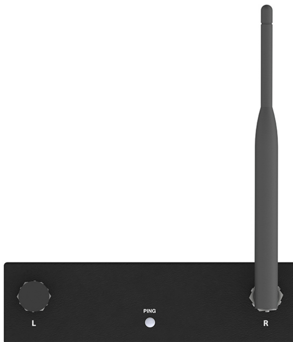
Figure 2: Top View of RT